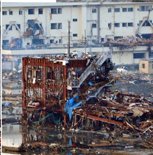
Fig.1 Disaster Prevention HQ of Rikuzen Takata City was hit by Tsunami to become a ruin.

http://f.hatena.ne.jp/youtube_girls/20110411205059